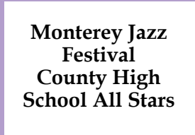
Judith Owen Wed., Aug. 13 th

Full Page Ad. . . . . $900 Half Page Ad. . . . . $600 10 Performances Capacity: 20,000 Material Deadline: Mon., June 2 nd